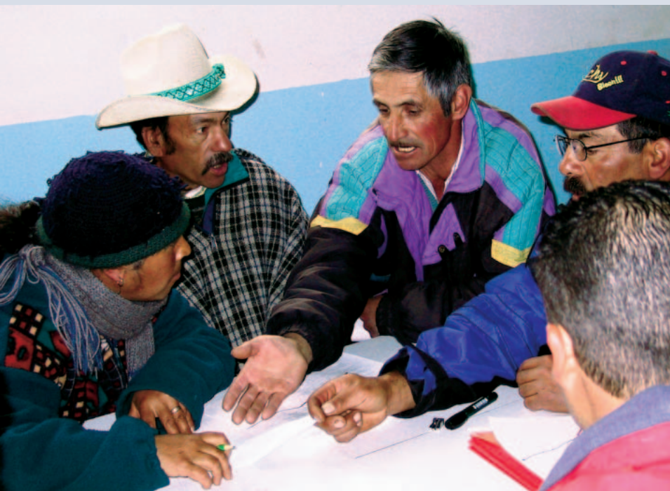
FIGURE 4 Discussion group during the problem analysis workshop in Gavidia. A community leader from the Women's Weavers Organization is arguing for the importance of increasing sheep numbers in the valley.

gies, and human welfare. On the other hand, the planning process incorporated the views of numerous stakeholders, including community-based organizations and regional government agencies (municipalities, National Park authorities, Ministries of Environment and Agriculture, etc).