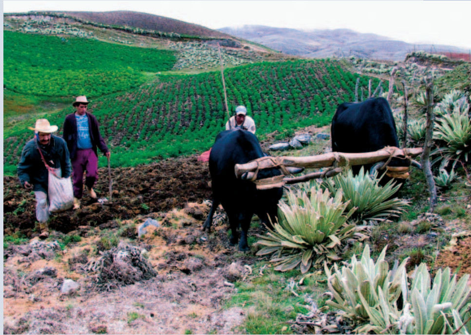
FIGURE 2 Farmers planting potatoes at 3100 m with the help of plows driven by oxen.

in the design of conservation plans. These plans will serve as blueprints for action during project implementation (6 years).