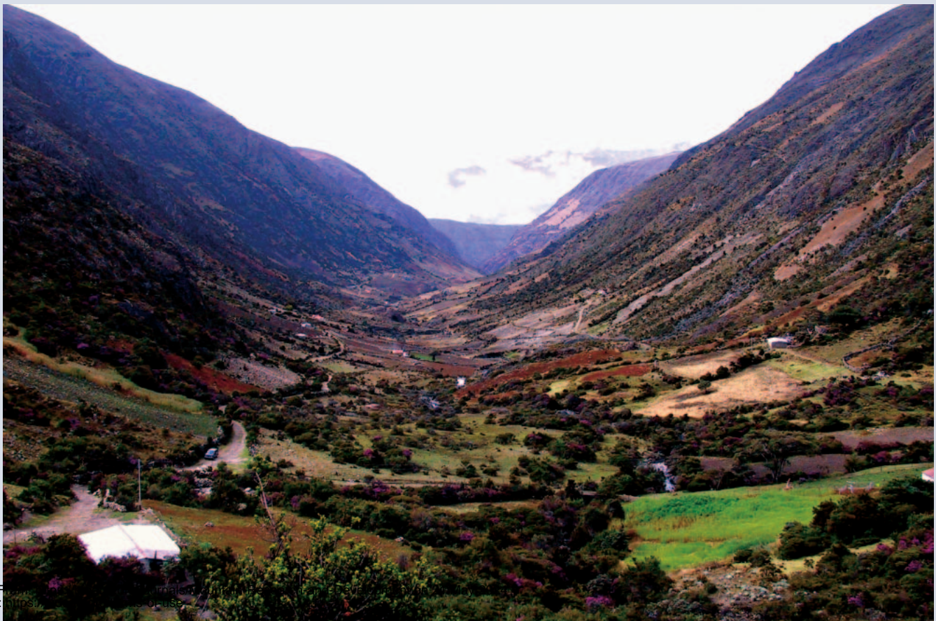
FIGURE 5 Pilot site in Gavidia. Fallow agriculture is practiced to cultivate potatoes. The agricultural zone occupies 19% of the total area (6030 ha) between 3200–4200 m. The 400 inhabitants also depend on extensive cattle raising; some derive their income from tourism. The dominant vegetation is a rosette-shrubland páramo.