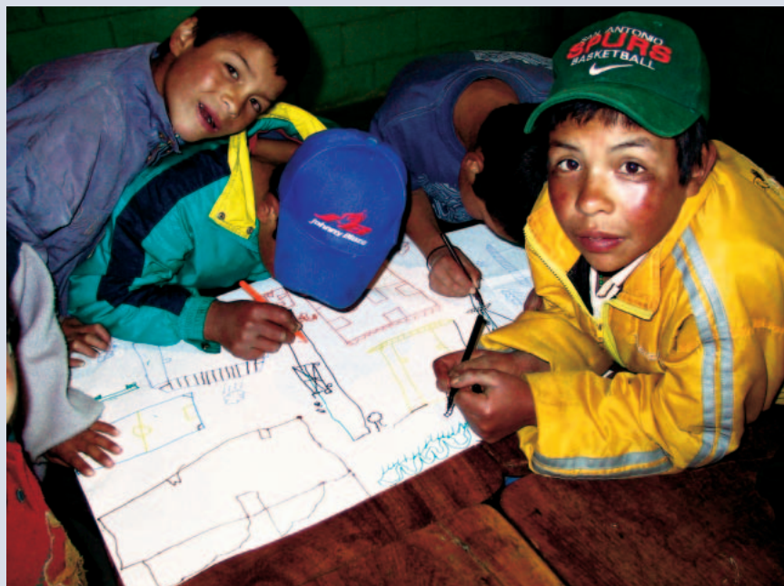
FIGURE 7 Children drawing their dream community in Tuñame during the problem analysis workshop.

process. In addition, preventing the violation of land use agreements will necessarily require strengthening the institutional capacity of community-based environmental organizations.